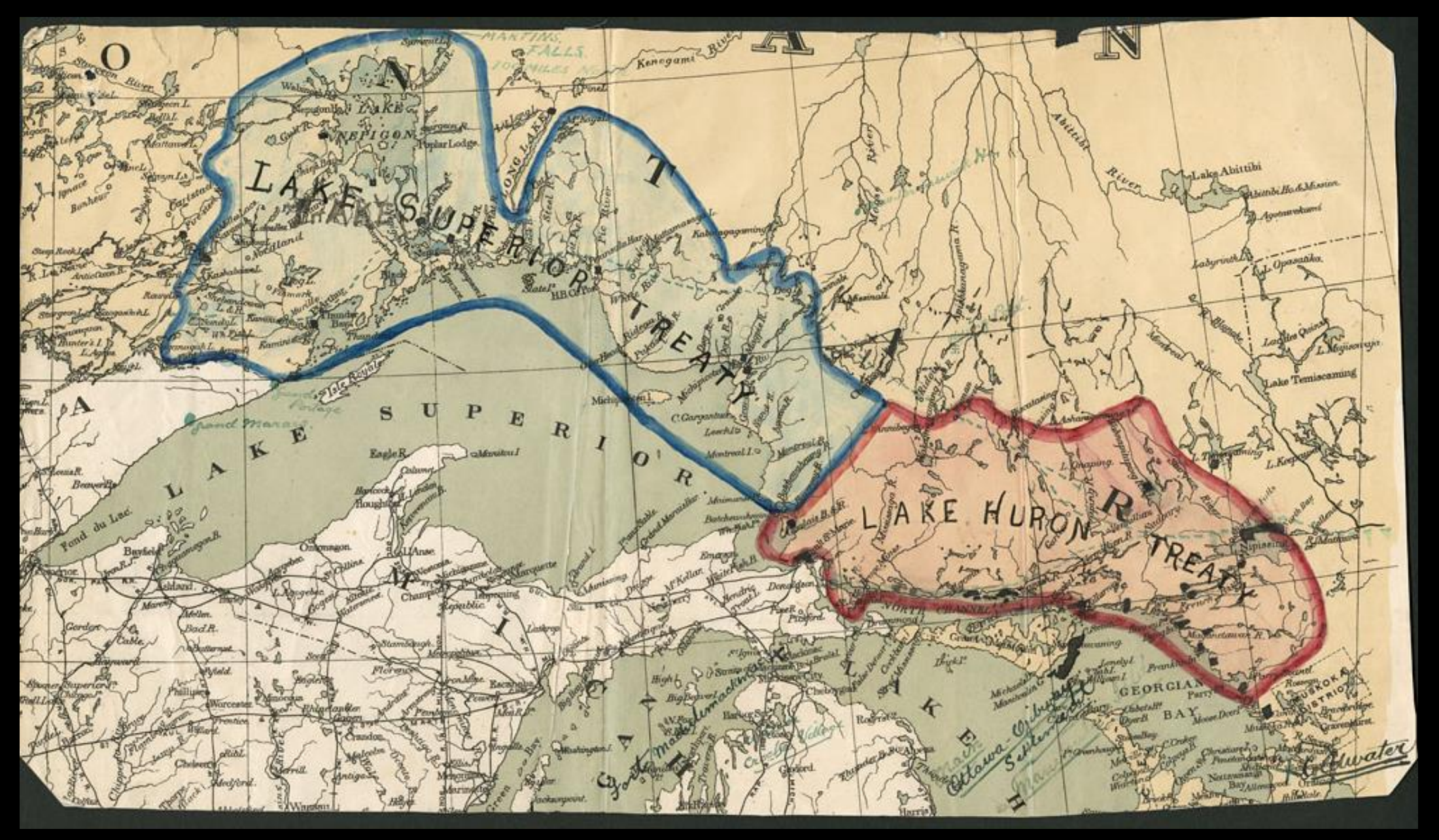
Source: LAC, Plan showing those areas of Ontario north of the Great Lakes affected by the Lake Superior Treaty and the Lake Huron Treaty, 1917. https://recherche-collection-search.bac-lac.gc.ca/eng/home/record?app=fonandcol&IdNumber=3695854